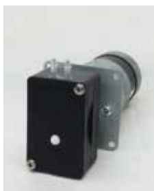
RP-H pump with brushless motor