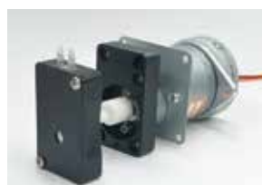
Pumphead is detached from the pump with stepper motor.

We recommend to use RE-C700 motor controller which is dedicated to use with RP-H pumps of stepper motor type.