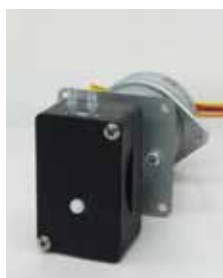
RP-H pump with stepper motor