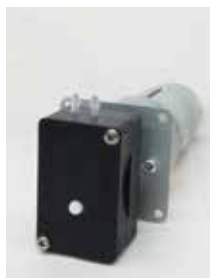
RP-H pump with brush motor

Analytical instruments, medical devices, cell culturing experiments and many other usage where micro-fluidic control is needed.